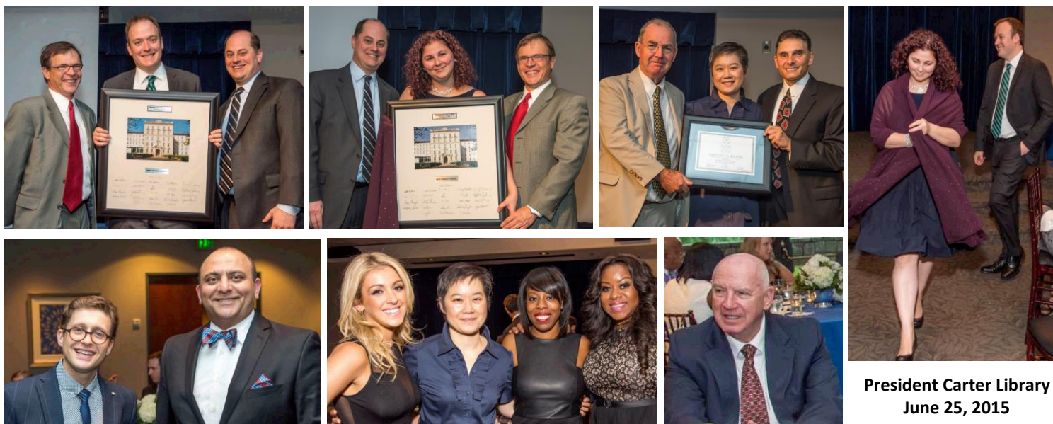
President Carter Library June 25, 2015