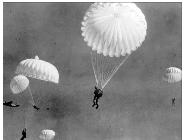
Parachutes reduce the risk of injury after gravitational challenge, but their effectiveness has not been proved with randomised controlled trials