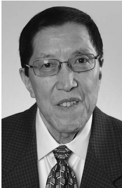
Derald Wing Sue

unmasked, the possible actions to be taken are unclear and filled with potential pitfalls. The reasons for inaction appear particularly pronounced and applicable to the expression of racial microaggressions (Sue et al., 2007), and racial macroaggressions , a concept to be introduced shortly (Huber & Solorzano, 2014).